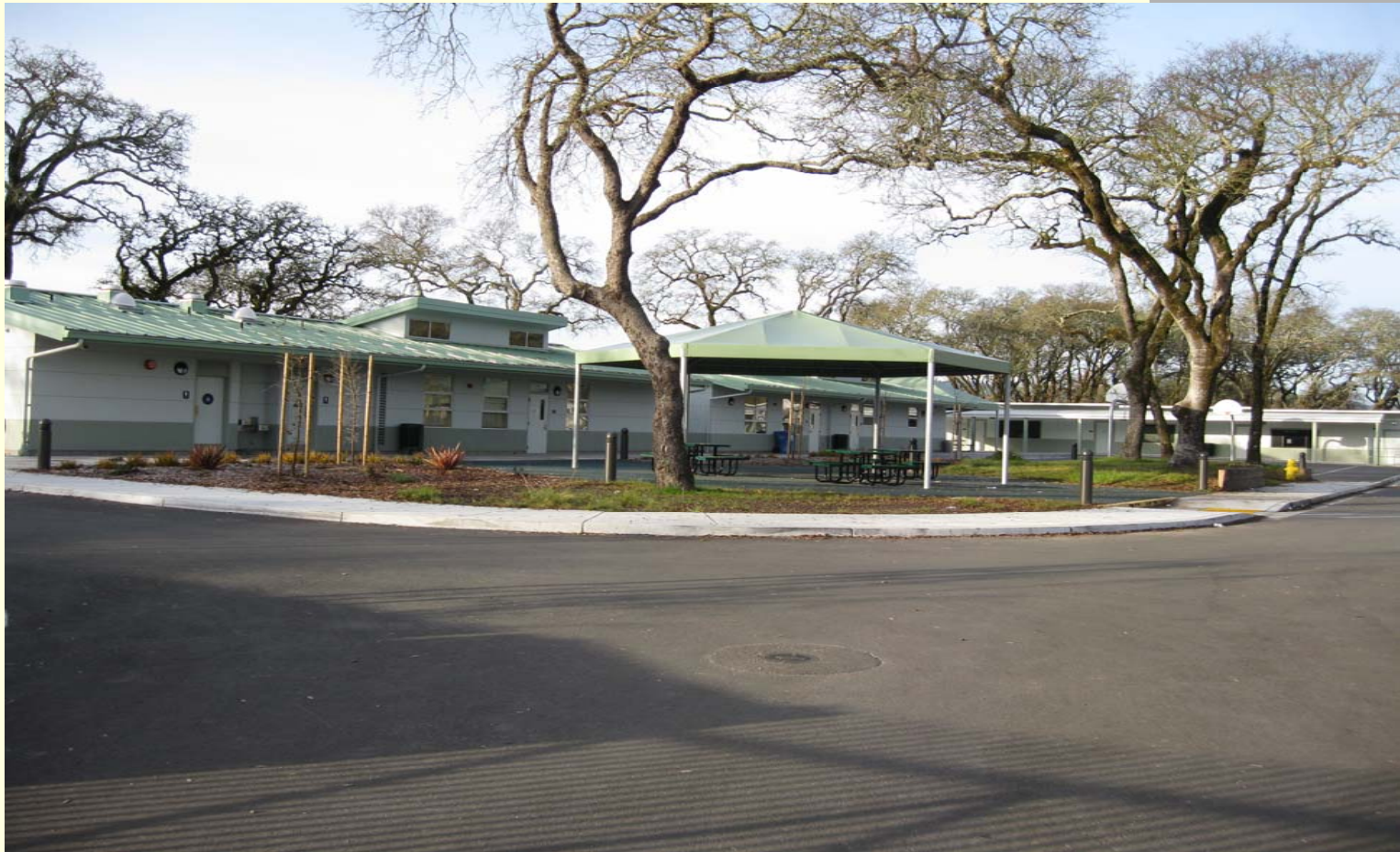
Cali Calmécac Language Academy Springfield Court