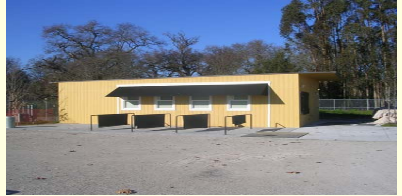
Windsor High School Snack Bar