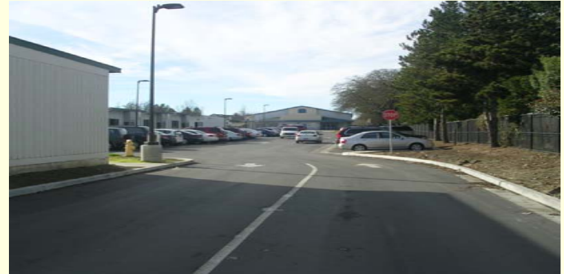
Cali Calmécac Language Academy North Parking Lot