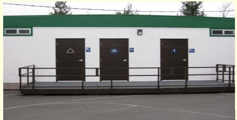
Windsor Oaks Academy Sewer & Water Connection