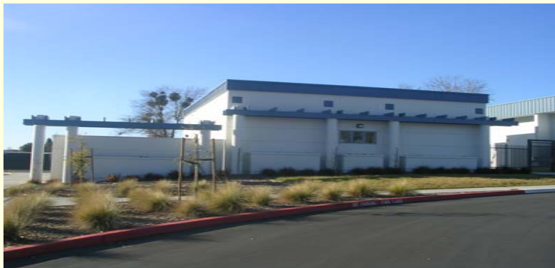
Cali Calmécac Language Academy Kitchen