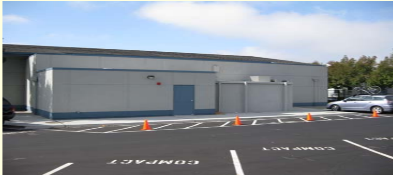
Brooks Elementary School Walk-in Freezer