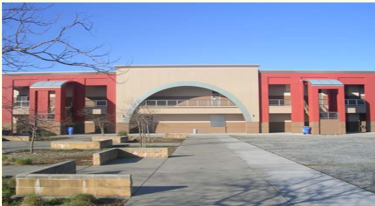
Windsor High School CTE Building