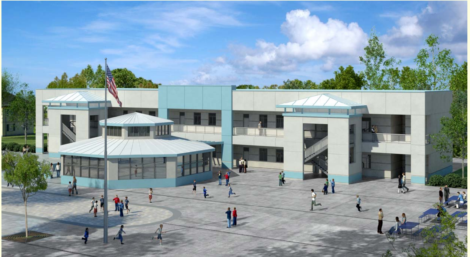
Brooks 2-Story Classroom with Library-in Design Est $7M