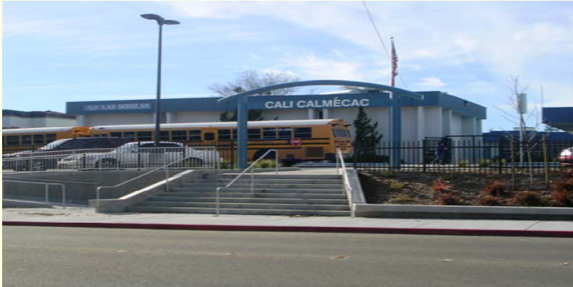
Cali Calmécac Language Academy Site Development