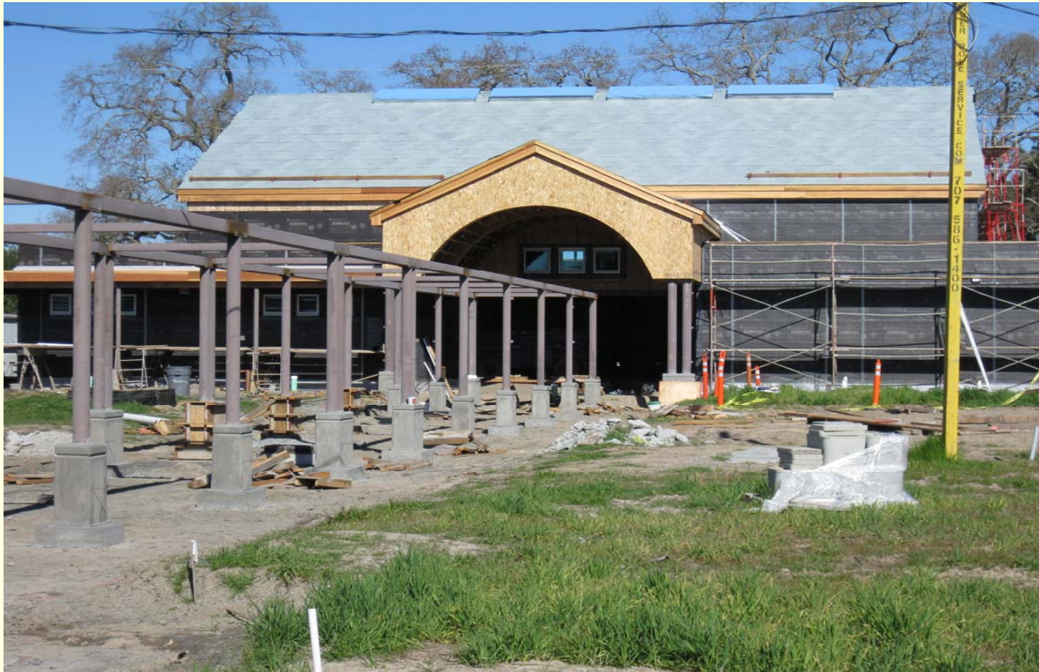
Mattie Washburn Elementary School Multi-Purpose Room