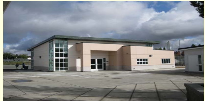
Windsor Middle School Music Building