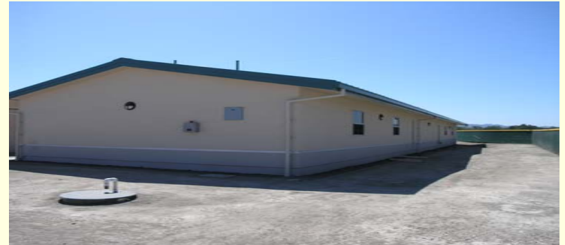
Windsor High School Science Classrooms