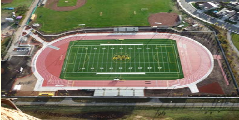
Windsor High School Kirkpatrick Stadium