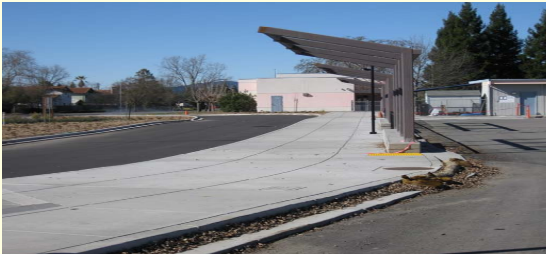
Mattie Washburn Elementary School Site Expansion