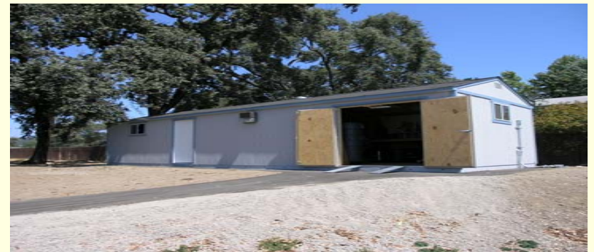
Mattie Washburn Elementary Portable Shed