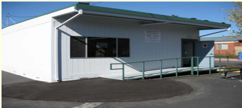
Windsor Oaks Academy Growth Project